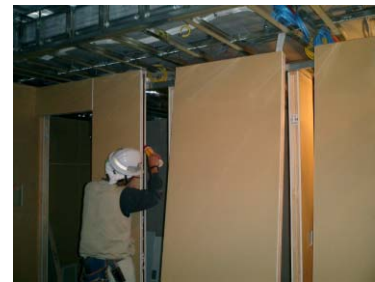
Workers install prefabricated interior wall panels.

"The five-day cycle was rough at first, but we gradually became used to it and work proceeded efficiently, I believe the small amount of waste and uncluttered worksite, along with one-floor-at-a-time operations, provided a benefit in terms of safety."