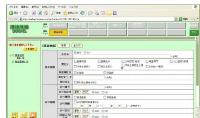
Screenshot of the Environmental Information System

Kajima has been working since 2002 to renovate its Environmental Information System, used to provide a record of the environmental management conducted at project sites and to allow for the Company-wide sharing of information. The revised system—which went online in May 2007—includes such features as a final disposal rate and mixed waste index for each project site to aid in setting management targets and the preparation of the environmental statements submitted to regulatory authorities, as well as an enhanced verification function to allow for more accurate risk management.