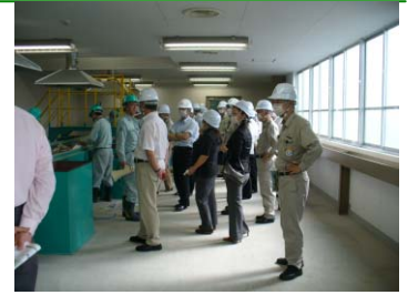
Branch office environmental managers conduct a joint inspection of MK Ecoplant Corporation's Osato Recycling Center.

Kajima's branch office environmental managers conduct on-site inspections of the facilities of firms that process the mixed waste and construction sludge to determine which of them are suitable for use at Kajima's project sites. Site managers select the contractors for their project site from each branch office's list of designated firms. The branch office environmental managers make regular inspections of the waste processing facilities of companies on the list, and three times yearly all environmental managers gather to conduct group inspections, and to reaffirm checklist items and appraisal criteria.