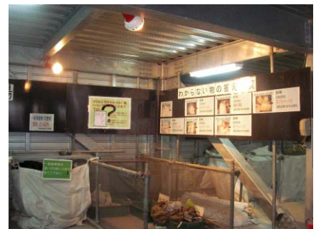
The collection area for indeterminate materials

Waste from project sites is often mixed together with the waste and cleanup of other contractors when being hauled to the collection area, becoming mixed waste. For this project, however, Kajima adopted a process in which only one type of work was conducted in any one work zone at a time. This reduced the number of waste types, clarified responsibility for waste, and allowed workers to more accurately sort the waste at the time it was generated. A special collection area was also installed for materials that could not be easily classified, which a waste processing company would regularly check. The proper sorting for these materials would be announced at the morning assembly and with signs, and workers reminded not to casually place items into the mixed waste box. Recycling channels for waste plastics and other materials that formerly were part of the final disposal were also developed in cooperation with waste processors, bringing the recycling rate to nearly 100%.