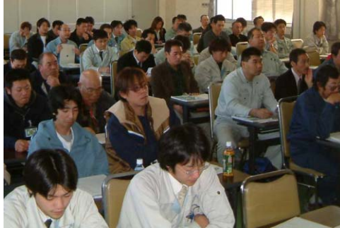
Training session for subcontractors' workers

At Kajima, employees and subcontractors' workers each receive a full range of safety and health education programs. For Kajima employees, there are basic trainings in relevant laws and company regulations, introductory management training focused on case studies, and project manager training covering risk management. In financial year 2006, these three training programs were completed by 123, 156 and 98 persons, respectively. For workers from partner companies, thorough training is conducted at the time workers are first employed, and again when they are assigned to a site for the first time. Specific training is also provided for supervisors as well as for persons assigned as safety and health controllers.