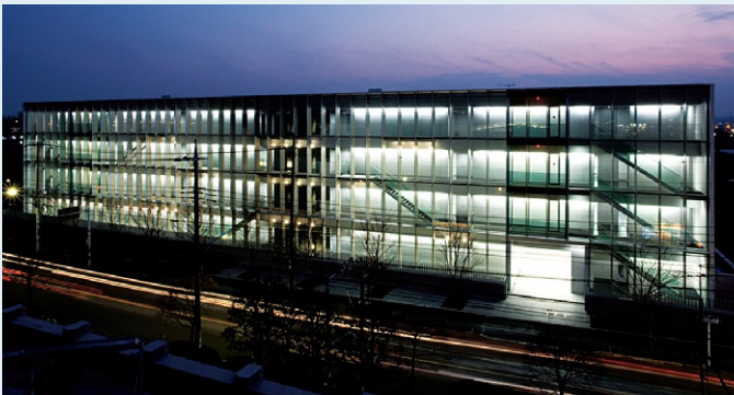
New test lab

In April 2009, Kajima opened a new test lab to study the needs of society and clients, and to better position the company to respond to emerging needs. Moving forward, Kajima will continue following its belief that taking on the challenges of each new age is a vital aspect of its social responsibility, and act on this belief with the same spirit of ambition that has been its hallmark since the company's founding.