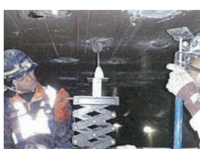
Overhead application (discharge channel)