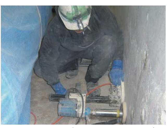
Construction at a narrow place (water treatment facility)