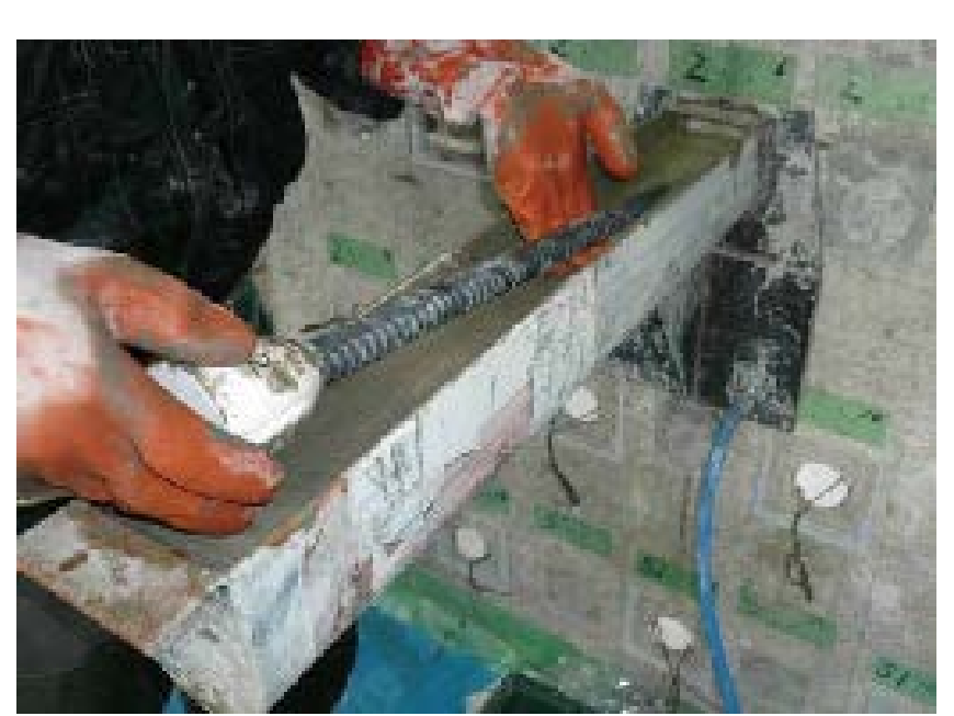
Insertion of a ceramic cap bar (CCb)