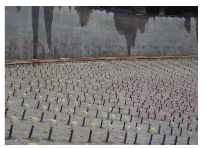
Reinforcement for a bottom plate of the gravity thickening tank