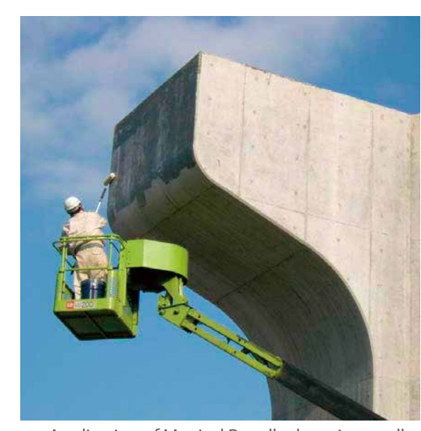
Application of Magical Repeller by using a roller

• Since is does not use organic solvents, the work environment is greatly improved and it is environmentally friendly material.