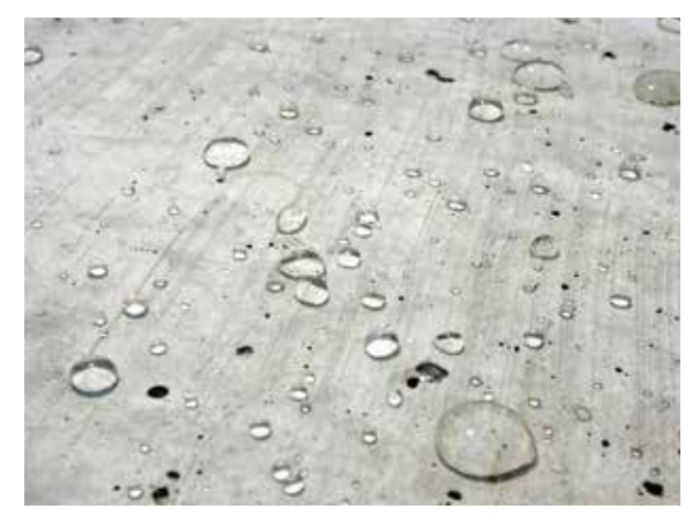
Water absorption prevention effect