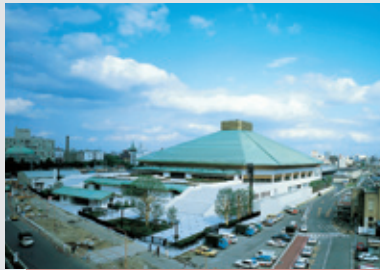
Kokugikan Sumo Arena