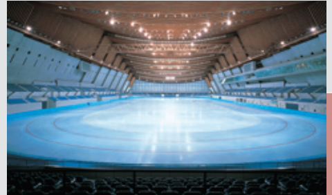
Nagano Olympic Memorial Arena