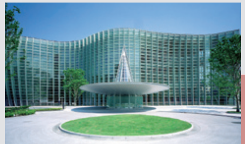
The National Art Center