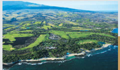
Hualalai Resort, Hawaii