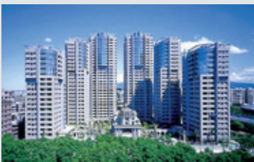
Treasure Palace (Condominium), Taiwan