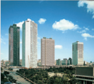
Sumitomo Shinjuku Building, KDDI Building, Shinjuku Mitsui Building