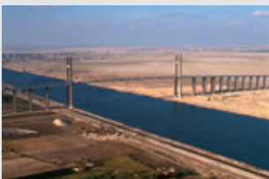
Mubarak-Peace Bridge, Egypt