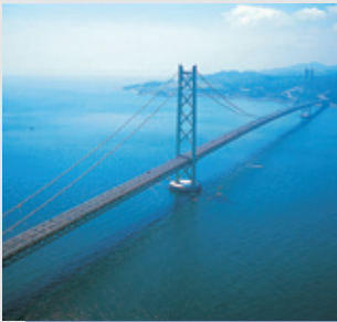
Akashi Kaikyo Bridge