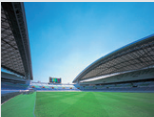
Saitama Stadium 2002