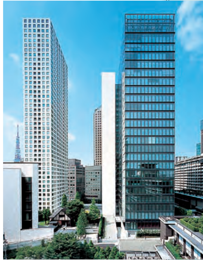
Toranomom Towers Office (Under operation since 2006)