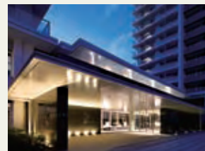
Entrance to Grand Mid Towers Omiya