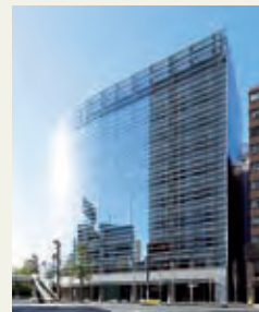
Aoyama Kajima Building

Glass Cube Shinagawa, a 13-story office building with a total rentable floor area of 13,503 m 2 , is one of the major office buildings recently developed in the Higashi-Shinagawa district. Ideally located with its quick access to Haneda Airport and Shinagawa Station, a bullet train stop, the district has been in demand from a growing number of Japanese firms seeking high-quality office space. Kajima's aim with this redevelopment project was to add an A-grade building to the district. Construction was completed as planned, and we sold the building to a Japanese investor in March 2011.