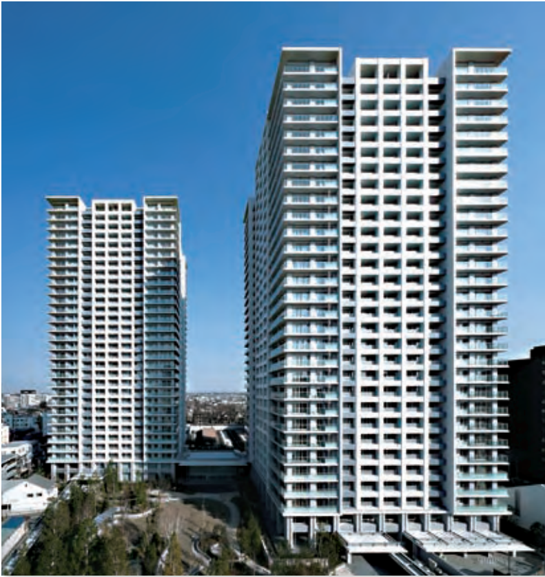
Grand Mid Towers Omiya

Projects completed during the fiscal year ended March 31, 2011