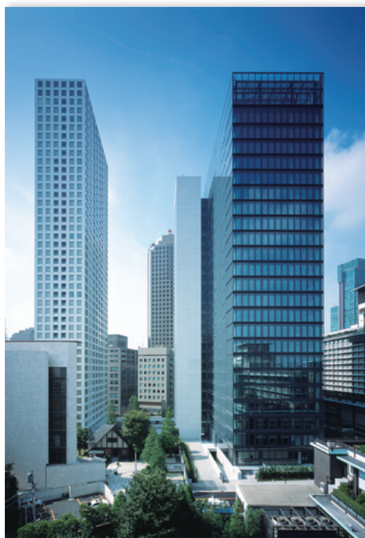
Toranomon Towers Office (Under Operation Since 2006)

Client: Kajima Corporation Location: Tokyo