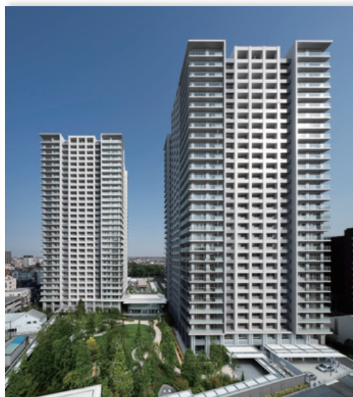
Grand Mid Towers Omiya

Projects completed during the fiscal year ended March 31, 2012