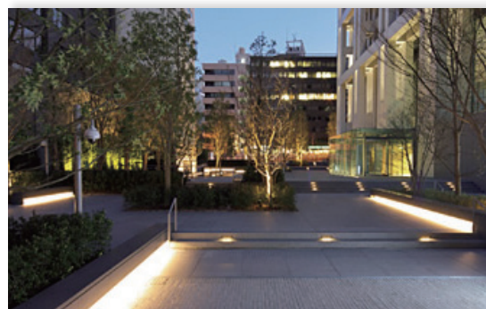
Plaza built with greenery