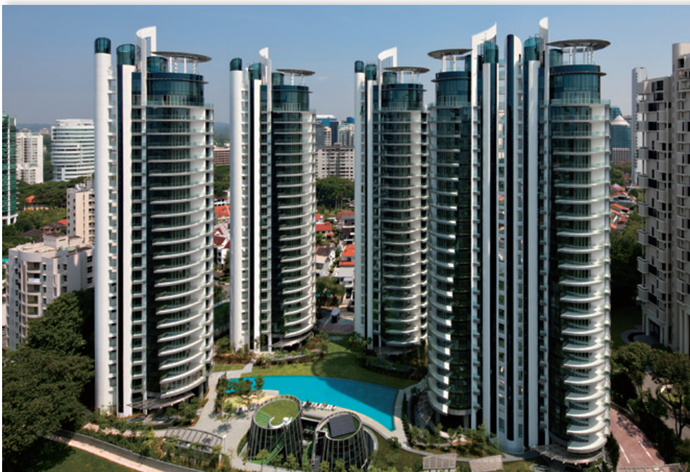
📍 Clivden at Grange

Client: NTT Communications Corporation Location: Singapore