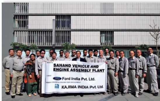
Kajima India celebrating its establishment

Business lines: Building design, construction and construction management; other consulting activities