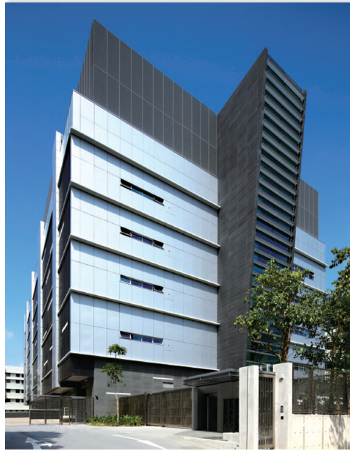
📍 Serangoon Data Center

Client: NTT Communications Corporation Location: Singapore