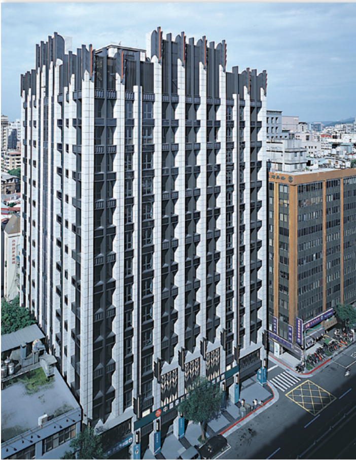
📍 Bosendorfer Plaza