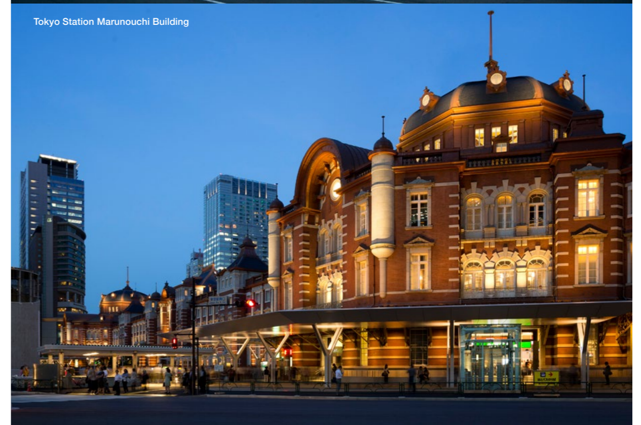
Tokyo Station Marunouchi Building