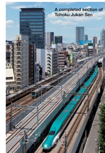
A completed section of Tohoku Jukan Sen

In the fiscal year under review, we have also received several key civil engineering orders in Japan. One, from Tohoku Electric Power Co., Inc., involves raising the seawall around the Onagawa Nuclear Power Plant in Miyagi Prefecture. Another, from the Ministry of the Environment, concerned decontamination work in Tomioka, Fukushima Prefecture. Major initiatives completed during the year included levee embankment work on the Isawa Dam and a Tokyo Port tunnel project for National Highway 357.