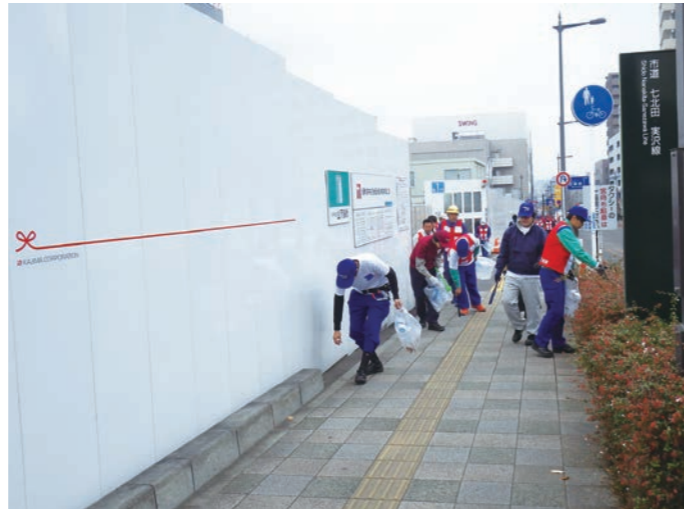
A total of 70 Kajima Group employees and partner company staff involved in the development project in front of Izumi Chuo Station took part in the Autumn Cleanup Campaign sponsored by the Association for Promotion of Izumi-ku Development in Sendai City.