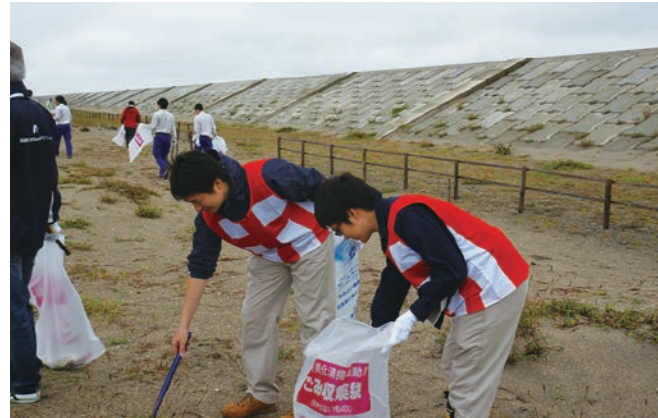
The 20th Hirosegawa River Cleanup Campaign took place in Sendai City, with 151 Kajima Group employees and their family members participating.

Kajima sites conduct themselves as members of their local communities, operating with the understanding of the community, local residents and concerned parties. The Kajima Group recognizes the importance of tailoring activities to suit local areas in order to maintain positive relationships with local communities. The Group ensures that areas around construction sites are kept clean and that construction does not interfere with work and school commuter traffic. Kajima also helps promote arts and culture, preserve local culture, and protect the prosperity of local communities by cosponsoring and participating in traditional and local events.