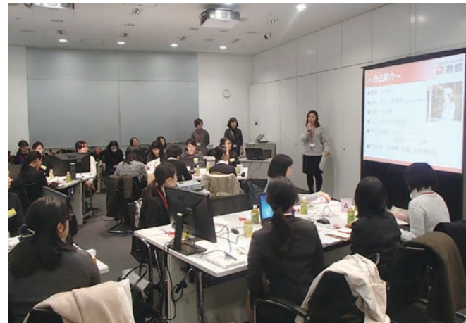
The Kajima Expo includes a forum specifically for female university students. The 2015 expo included tours of Kajima construction sites and the Kajima Technical Research Institute.

Held since fiscal 2014, the Kajima Expo shows university students how the knowledge they gain in university is applied outside of the classroom. The expo offers tours of civil engineering and construction sites and the opportunity to talk with female engineers, providing a first-hand overview of the work done by Kajima. The Company also plans to introduce a new program for high school students in fiscal 2016.