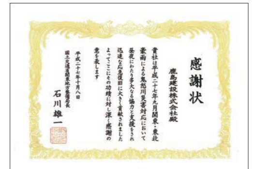
Construction to repair the bank of the Kinugawa River involved 24 Kajima employees and some 3,000 employees from 47 partner companies. The repair work took two weeks to complete. A letter of appreciation was received from the local authorities (photo above).