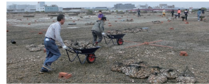
Twenty-four Kajima employees, their family members and friends volunteering to help protect a little tern nesting spot.

Kajima has also been recycling the work clothes worn by employees on construction sites since 2010, cooperating with the group company Taiko Trading Co., Ltd. By fiscal 2014, some 15,000 sets of work clothes had been recycled