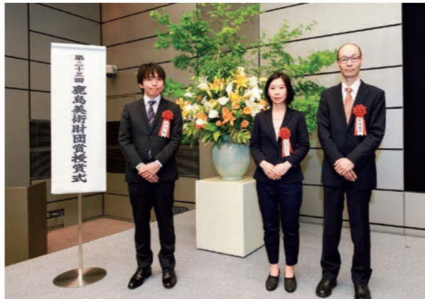
The award ceremony, grant presentation ceremony, and research presentation were held in May 2016.