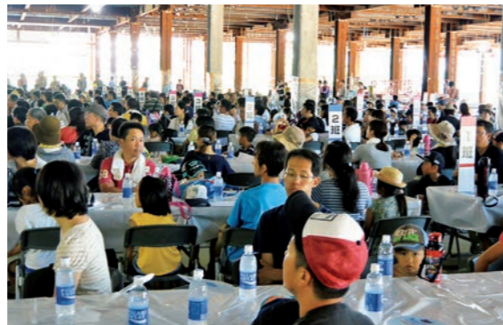
Five hundred local children and their family members were invited to tour the building and grounds under construction for the AEON Mall Imabari Shintoshi and to see the heavy machinery that the crew uses.