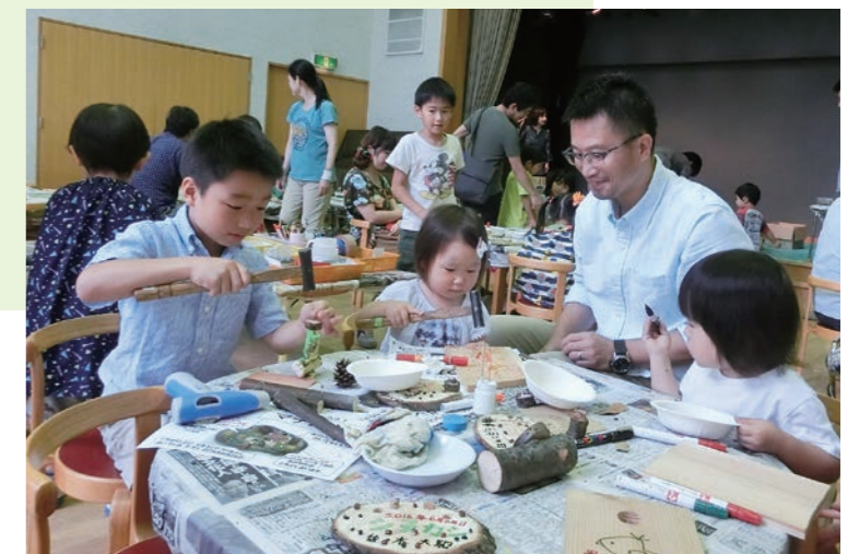
Parents and children living in Kajima company housing take part in workshops held since fiscal 2010.