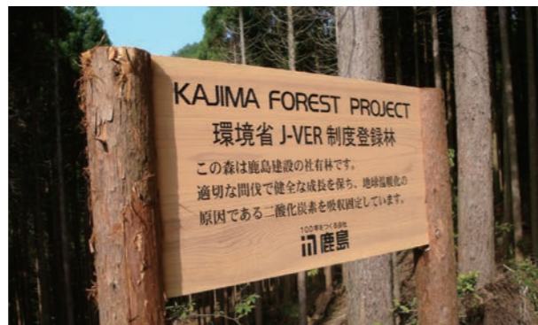
A Kajima forest project in Miyazaki Prefecture, registered under the J-Ver scheme.

work, rendering five construction sites carbon-free. Kajima will continue to maintain the forestland it owns and pursue conservation that highlights the new environmental value of forests, including absorption and fixing of CO2, biodiversity, and the emotional wellbeing provided by the forest experience.