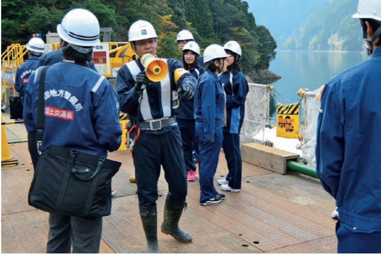
Thirty-one students from Anan College at the National Institute of Technology tour the local Nagayasuguchi Dam Renovation Project site.