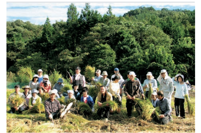
Participants in the fiscal 2015 Fukushima study tour harvest rice.

The Kajima Foundation for the Arts, established in 1982, provides grants for research in the arts, related publications, international exchange, and projects to foster art dissemination, aiming to foster the arts and enrich Japanese culture. In fiscal 2015, a total of ¥43.38 million was allocated to 64 research projects. Research results are presented each year, and the foundation honors the project which produced the most outstanding results.