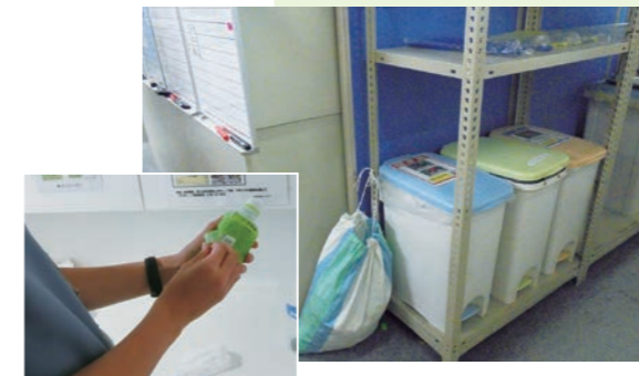
Ecocap Movement: From 2008 to May 2016, Kajima collected approximately 3.68 million caps from plastic bottles, the equivalent of a 27-ton reduction in CO2 emissions.

across Japan. In 2015, the Ecological Life and Culture Organization recognized this initiative with a Commendation for Distinguished Service in Promoting Recycling Societies.