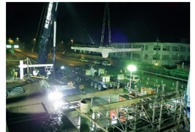
Construction crews worked day and night to repair the Kyushu Expressway after the Kumamoto earthquake.

In September 2015 when the bank of the Kinugawa River ruptured, and in April 2016 when the earthquake struck in Kumamoto, Kajima helped with recovery in both leadership and support roles in close cooperation with relevant government offices and business organizations.