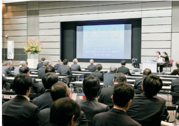
Research results being presented at the 38th Kajima Research Presentation (November 2015).

Established in 1966, the Kajima Institute of International Peace promotes international peace and strives to contribute to Japan's security. It studies and provides funding for research on international peace and security, economic matters, and issues concerning Japan's foreign relations, and then publishes the research findings.