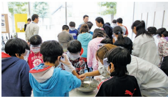
Students from local elementary schools are invited to tour the Kajima Technical Research Institute every year on Civil Engineering Day (November 18).