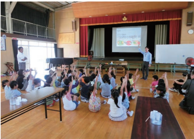
Kajima conducts a hands-on class on Japanese honey bees at Kure City Konan Elementary School in Hiroshima Prefecture.