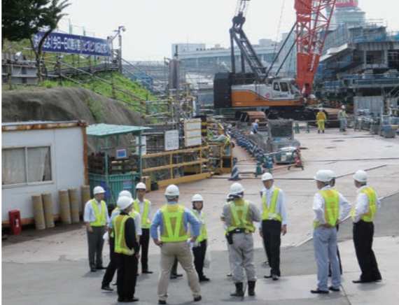
Kajima is part of the study program for educators sponsored by the Japan Institute for Social and Economic Affairs. The program, held each year during summer vacation, teaches educators about private sector corporate activities.