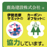
This logo certifies participation in the carbon-offset scheme.

Kajima has used a portion of its credits to offset CO2 emissions in its construction