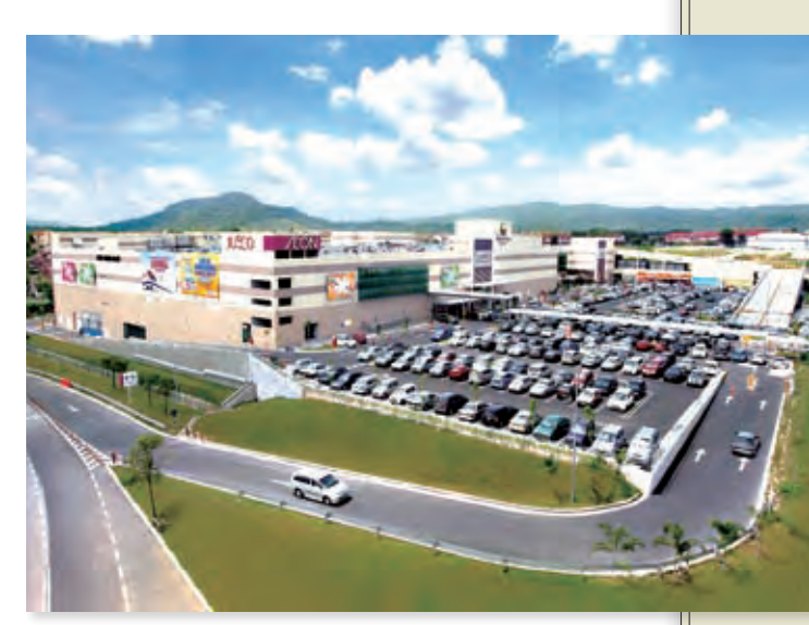
AEON Mahkota Cheras Shopping Center, Malaysia