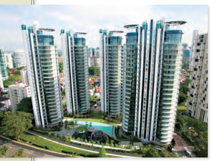
Cliveden at Grange, Singapore