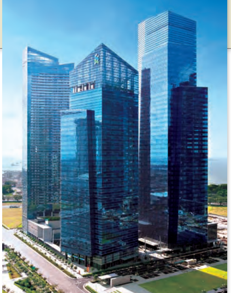
Marina Bay Financial Centre, Singapore