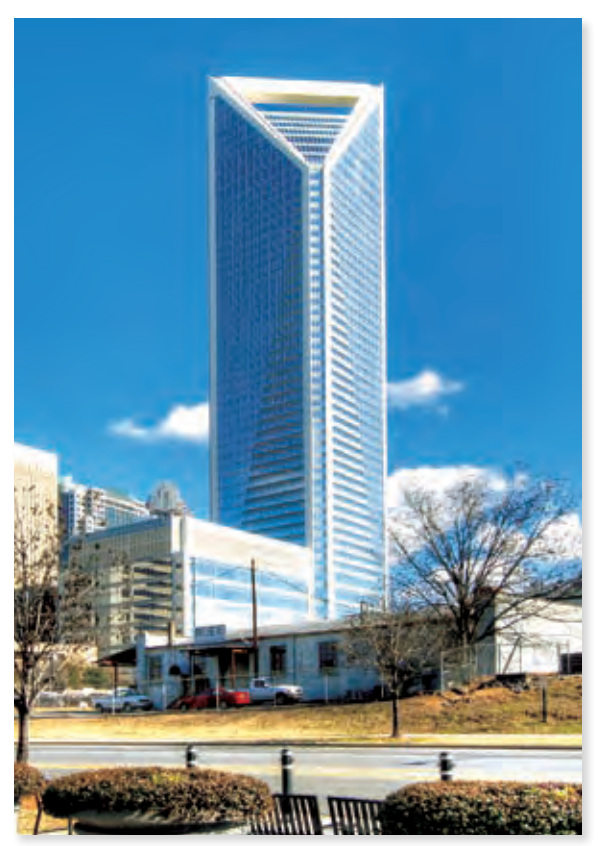
Duke Energy Center, USA