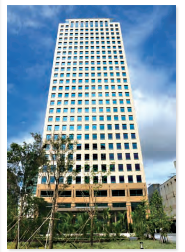
Sentral Senayan Ⅲ, Indonesia

Projects completed during the fiscal year ended March 31, 2011