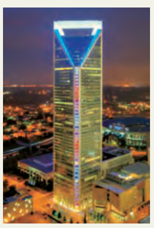
Duke Energy Center (Constructed by Batson-Cook Construction)

taking proactive steps to develop overseas by eyeing M&A opportunities with prominent local companies in markets where it hopes to establish a foothold.