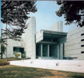
1974 Supreme Court