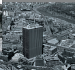
1968 Kasumigaseki Building