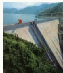
1961 Okutadami Dam