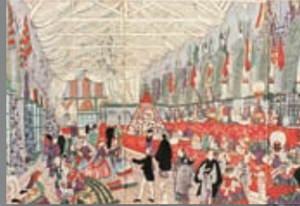
1860 Ei-Ichiban Kan