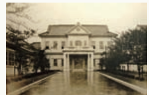
1878 Okayama Prefectural Office