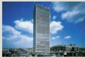
1978 Sunshine 60 Building