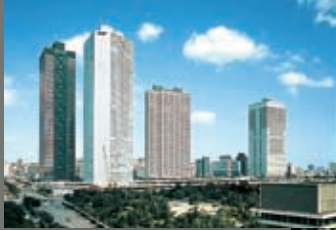
1974 Sumitomo Shinjuku Building, KDDI Building, Shinjuku Mitsui Building