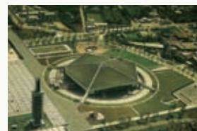
1964 Komazawa Olympic Gymnasium