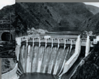
1924 Ohmine Dam