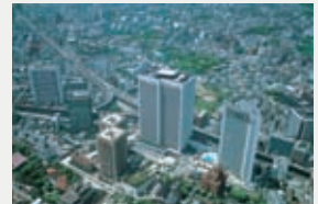
1986 ARK Hills