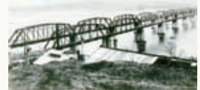
1899 Built railroads in Taiwan, Korea, etc.