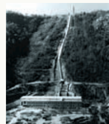
1960 Baluchaung Hydroelectric Power Plant, former Burma