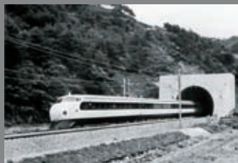
1963 New Tanna Tunnel