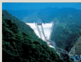
1997 Miyagase Dam