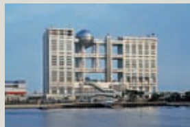
1996 Fuji Television Head Office