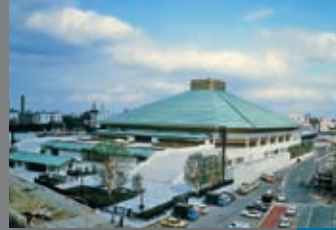
1984 Kokugikan Sumo Arena