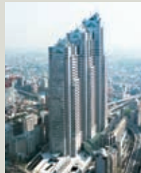
1994 Shinjuku Park Tower