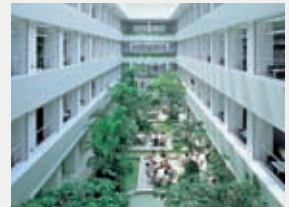
1989 Kajima KI Building