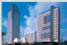
1997 Millenia Singapore