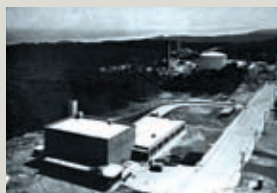
1957 No.1 Reactor, Japan Nuclear Power Research Center