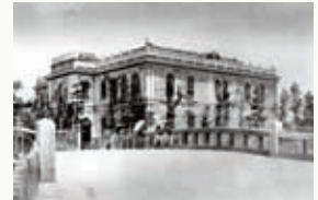
1872 Houraisha Office