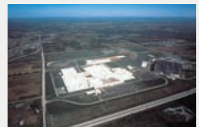
1987 Mazda Detroit Plant, USA