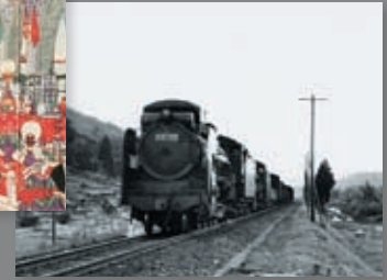
1880 Began construction of Yanagase Railroad