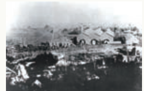
1874 Papermaking Company (Oji Paper) Factory