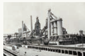
1962 Tobata Iron Mill, Yawata Iron and Steel Co., Ltd.