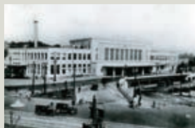
1934 Ueno Station