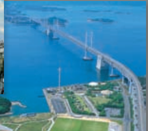
1988 Honshu-Shikoku Bridge