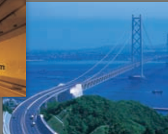
1998 Akashi Kaikyo Bridge