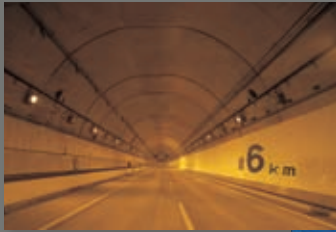
1997 Tokyo Wan Aqua Line