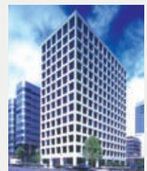
2007 Kajima Head Office