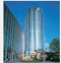
2003 Roppongi Hills Mori Tower