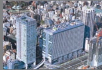
2005 Akihabara Crossfield