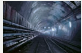
1988 Seikan Tunnel