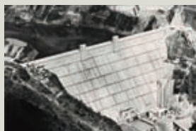
1957 Ogouchi Dam