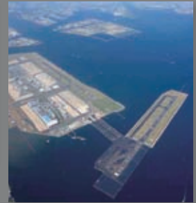
2010 D-Runway, Tokyo International Airport