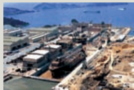
1972 MHI Kouyagichou Dock