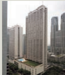
1971 Keio Plaza Hotel