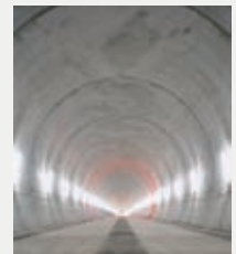
2004 Hakkoda Tunnel