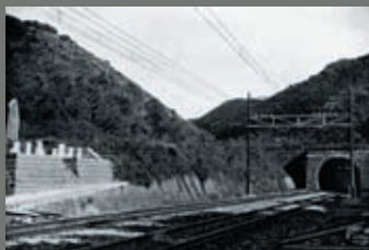
1918 Began construction of Tanna Tunnel (17-year project)