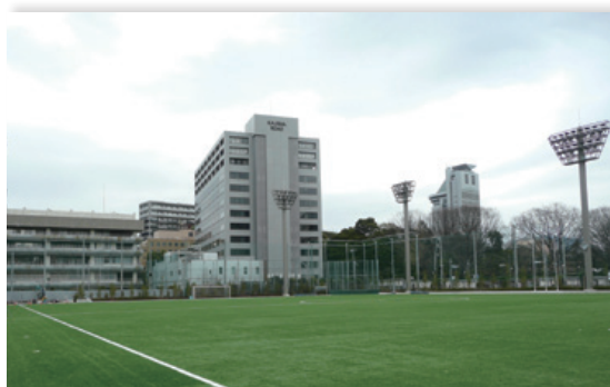
Koishikawa Playground of Bunkyo-ku, Tokyo

Kajima Road Co., Ltd. has helped construct various sporting facilities over many years. It has a proud and proven track record in particular in constructing all-weather surfaces for field athletics, tennis and other sports that demand a high level of base pavement. Looking ahead, the company will work to promote the introduction of this long pile turf in all manner of sports grounds, including soccer, baseball, American football, rugby, gateball (a Japanese form of croquet) and school playgrounds.