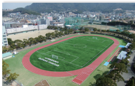
Athletic fields of Kyushu Sangyo University